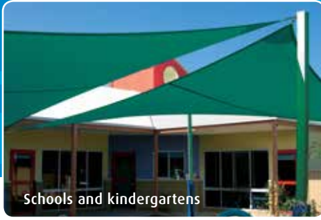
Schools and kindergartens